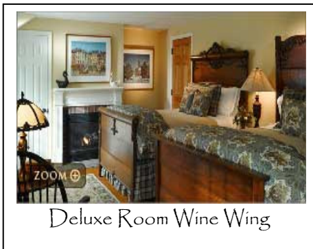
Deluxe Room Wine Wing