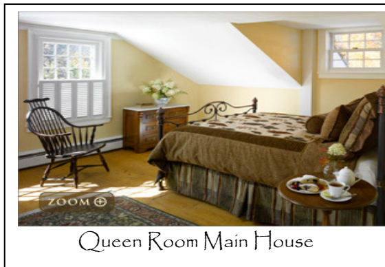
Queen Room Main House