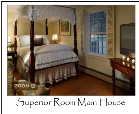
Superior Room Main House