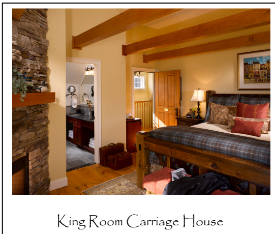
King Room Carriage House