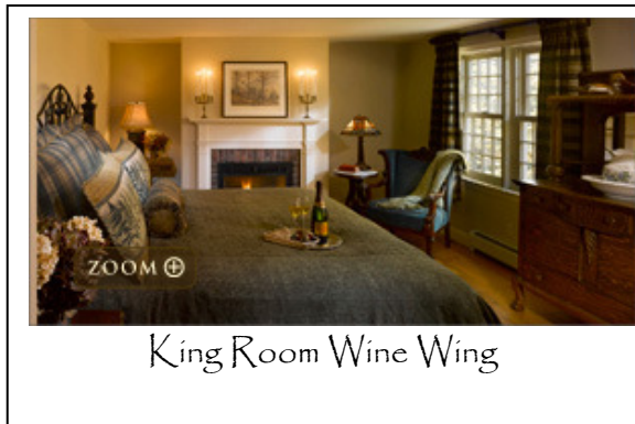
King Room Wine Wing